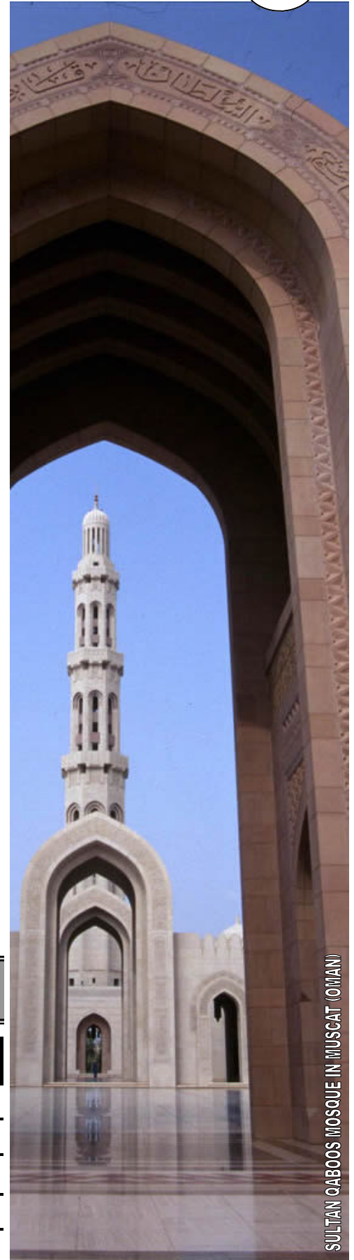
SULTAN QABOOS MOSQUE IN MUSCAT (OMAN)

Believing women Islamic Tarbiyyah & Educational Classes Every Friday 7:30pm to 9pm Darnley Family Centre 175 Darnley Street Pollokshields, Glasgow, G41 2SY Contact: 07780 707 729